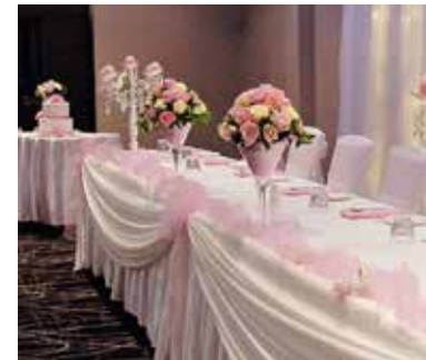
Skirting - Present Table $15-$20