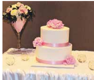
Skirting - Cake Table $15-$20