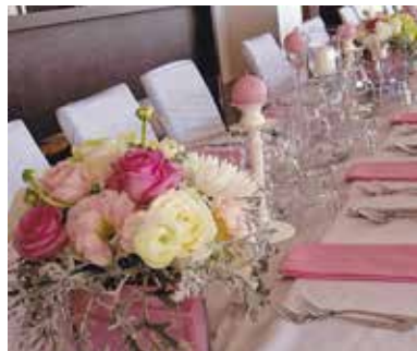
Table Cloths $9-$12 each