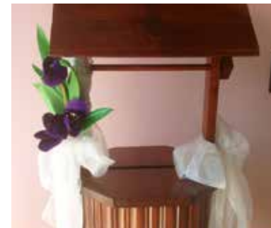
Wishing Well $20 each