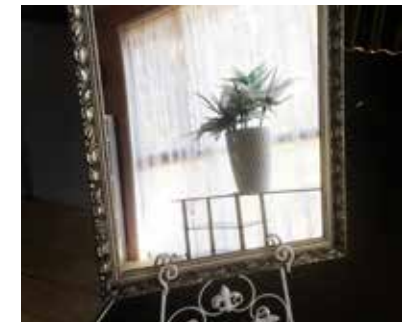
Easels/Mirrors $15 each