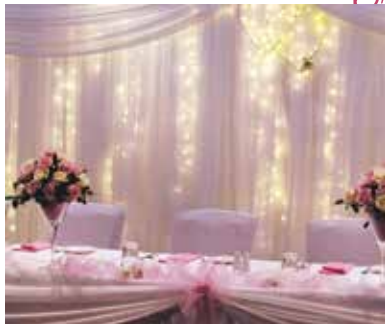
Back Drop + Fairy Lights $120