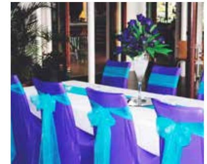
Lycra Chair Covers $5/chair