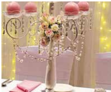
Centre Pieces $10-$35 each