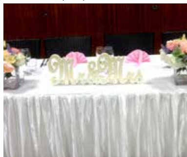
Mr & Mrs Sign $5 each