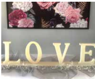
Love Sign $5 each