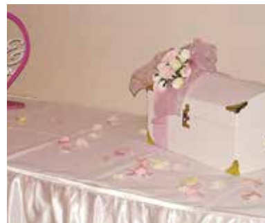
Treasure Chest $20 each