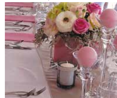
Sashes $1 each Table Runners $2 each