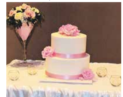
Tea Lights $2 each