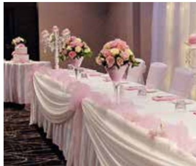
Skirting - Bridal Table $30-$40